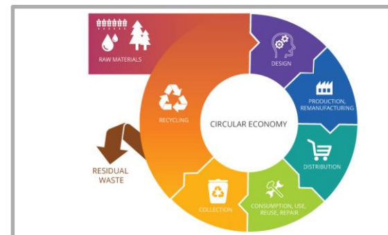
DESIGN FOR CIRCULAR ECONOMY